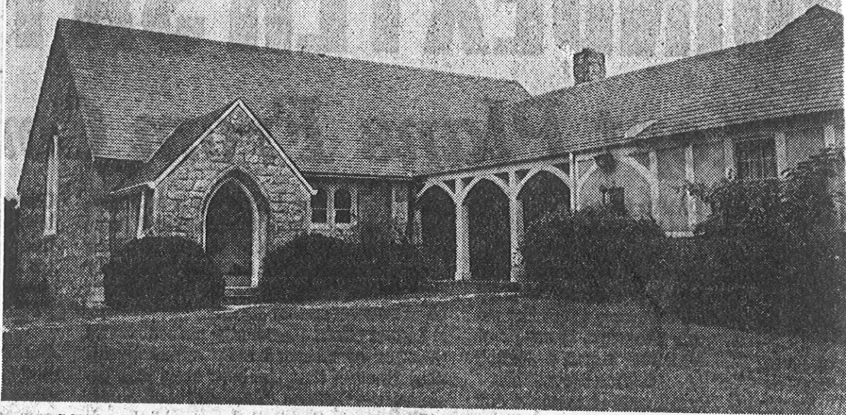
SCHOOL CHAPEL — County officials are hoping an adaptive reuse will be found for the former chapel of Bonny Oaks School.